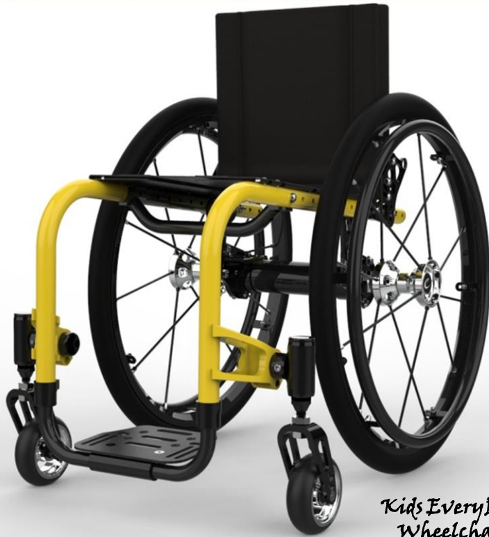
Kids Every Day Wheelchair